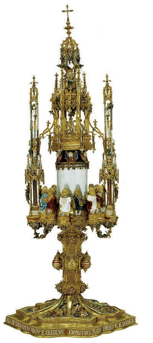
Custódia de Belém

The orientation of the interaction at a moment m to a sub-domain t is based on the history of formulated questions, and defined as I_{t(m)} .